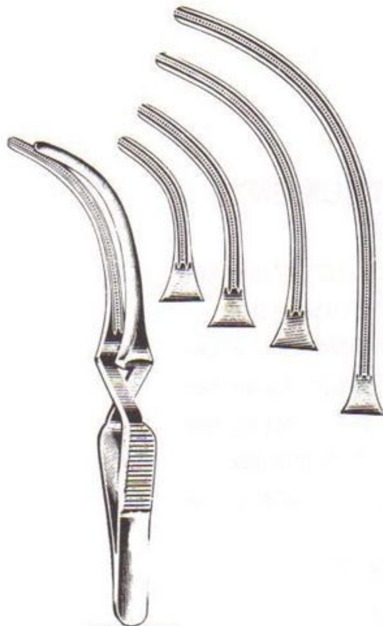
645-457 through 645-474