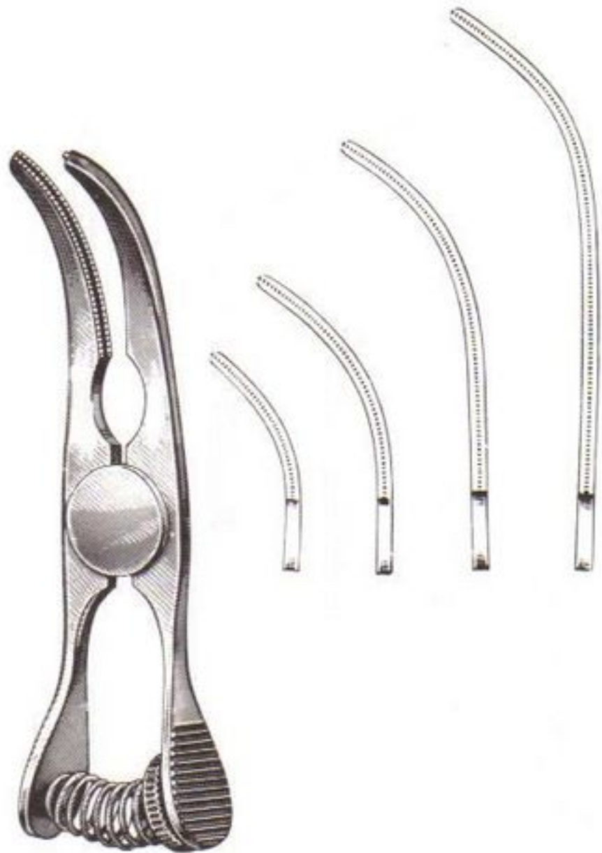
645-101 through 645-135