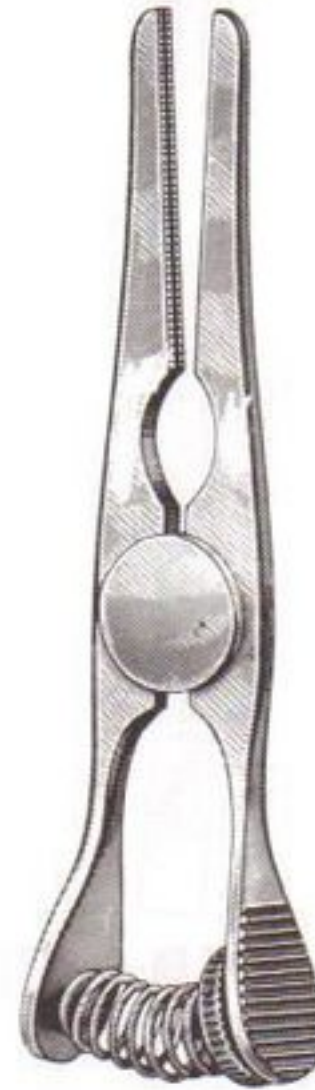
645-002 through 645-036