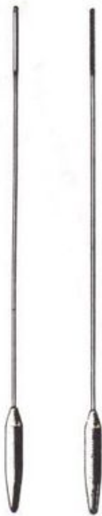
780-056 through 780-080